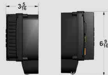
View with wall mount