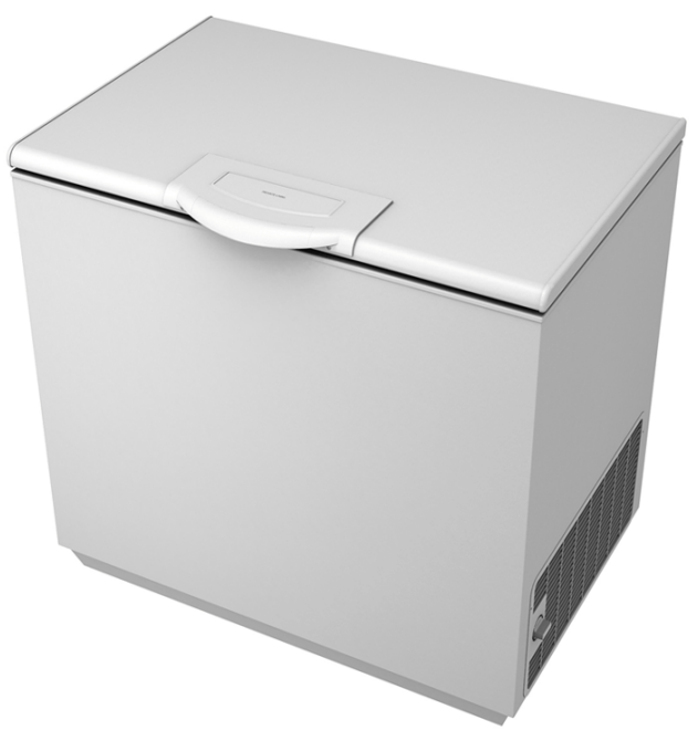
SunDanzer<sup>™</sup> units are manufactured in a highly automated factory by one of the world's leading appliance manufacturers to SunDanzer's stringent standards for quality and efficiency.